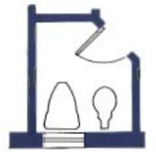
Alternate Master Bathroom