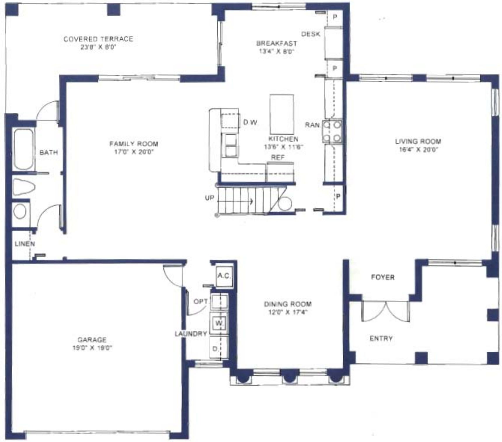
Iris Elevation One First Floor